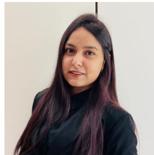
Krushi Nagar (GM)